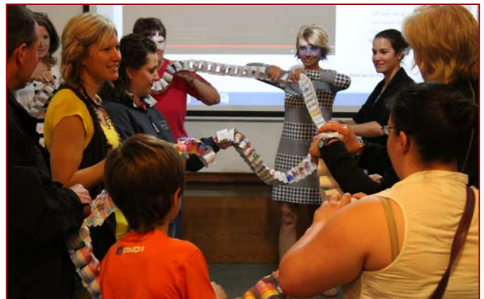
Breaking the chains of abuse

Family Connections is the Alliance's home visitation program that serves families of children under the age of three, having incomes under 185% of the poverty level and residing in Andrew, Buchanan, Clinton or DeKalb counties. Using the Parents as Teachers Foundational curriculum, home visitors strive to increase: school readiness; child well-being, including physical, emotional and social development; and the prevention of child abuse.